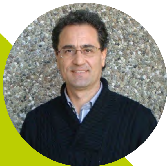
Prof. Dichio Bartolomeo

Today the competition for scarce water resources in many places at global level is intense. Available water resources are constantly diminishing at increasing rates. Adaptation of agriculture to varying conditions induced by climate change is necessary because some changes in climate can no longer be prevented.